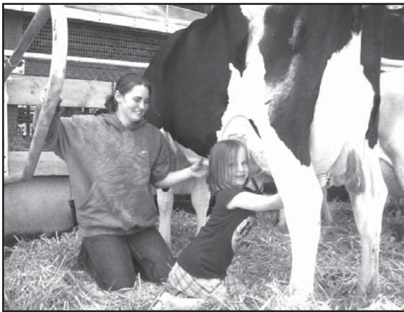
Breakfast on the Farm