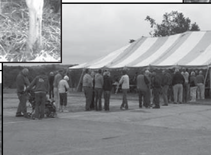
June 11, 2011