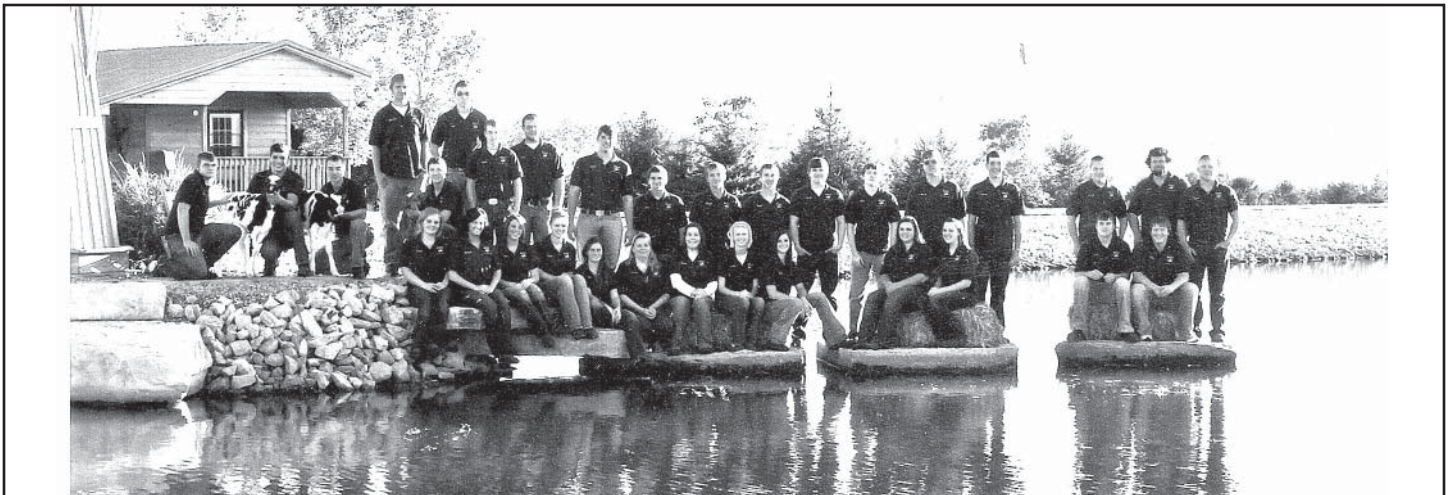
2011 Dairy Science Club

Paul Bodensteiner Dairy, IA Waukon Vet Clinic, IA Curtiss Dairy, IA New Hampton Vet Clinic, IA Daley Farms, MN Ketchum Dairy, MN E & M Dairy, IA Minnesota Select Sires, MN Elsbernd Acres, IA Fjelstad Dairy, MN Lely Robotics, IA D & D Dairy, MN Custom Hire Operation, NY Cresco Vet Clinic, IA Guttenberg Vet Clinic, IA Moger Dairy, MN Shindler Goat Dairy, IA Schmitt Dairy, IA Terra McCreere Holsteins, MN