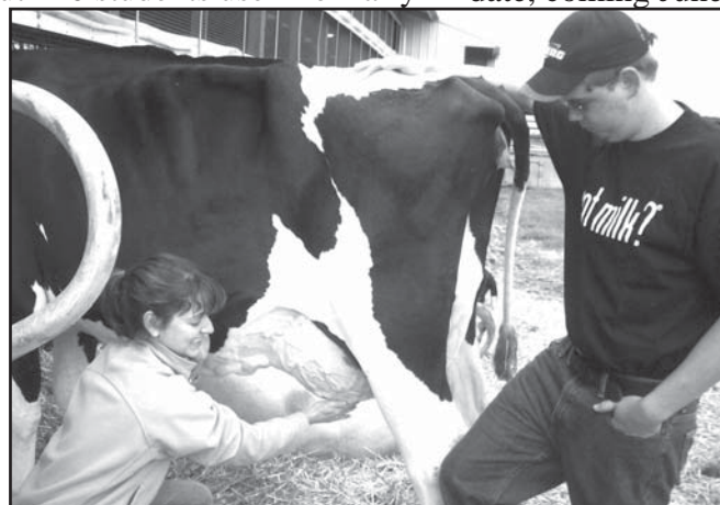
Photo: Many visitors enjoyed the experience of being able to milk a cow, provided by the NICC Dairy Science Club.

Be sure to keep your eyes open for next years Breakfast on the Farm date, coming June 2012!